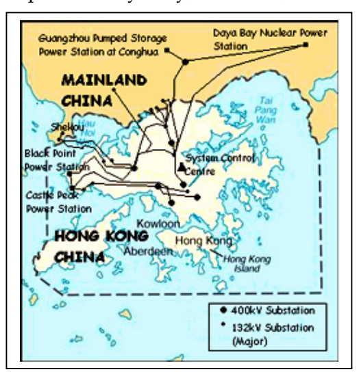
Figure 2: Exisiting CLP's power grid extending from the New Territories, Hong Kong, into Guangdong

Hong Kong has been connecting to Guangdong's provincial power grid. As a matter of fact, Hong Kong and Guangdong have over two decades of experience in sharing power on their common grid (CLP, one of the two power utilities in Hong Kong, has been selling electricity to Guangdong since the late-1970s and CLP has been importing nuclear energy from the nuclear plant in Daya Bay, Shenzhen, since the mid-1990s) (Figure 2).